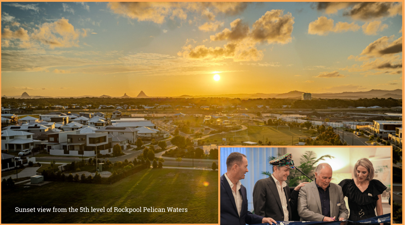
Sunset view from the 5th level of Rockpool Pelican Waters